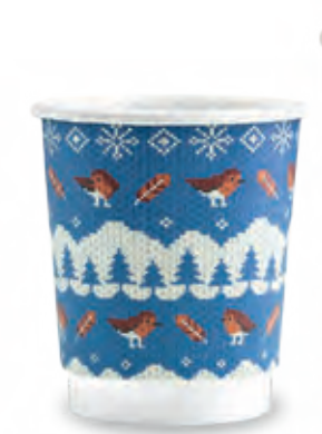
77471 (8oz) 1x500 £51.29 10p each